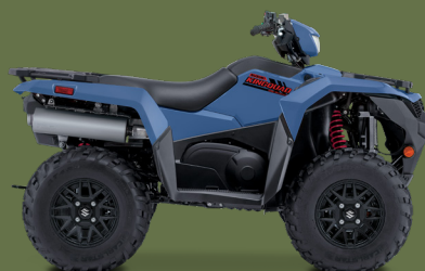
Armored Blue Gray

The KingQuad 500AXi Power Steering SE is not just an ATV, it's a KingQuad ATV. Suzuki, the inventor of the 4-wheel ATV, has created the world's best sports-utility quad with bold styling plus more capability and reliability than ever before. The legacy of the iconic KingQuad remains fresh and exciting and is ready for riders to join its history. The 2026 KingQuad 500AXi Power Steering SE helps tackle challenging terrain with the capabilities that only a KingQuad possesses.