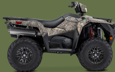
True Timber Kanati

The KingQuad 500AXi Power Steering SE Camo is not just an ATV, it's a KingQuad ATV. Suzuki, the inventor of the 4-wheel ATV, has created the world's best sports-utility quad with bold styling plus more capability and reliability than ever before. The legacy of the iconic KingQuad remains fresh and exciting and is ready for riders to join its history. Ready for outdoor adventure, the 2026 KingQuad 500AXi Power Steering SE Camo helps tackle challenging terrain with the capabilities that only a KingQuad possesses.