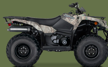
True Timber Kanati

Ready to take riders on their next outdoor adventure, the 2026 Suzuki KingQuad 400ASi Camo is wearing True Timber® Kanati pattern camouflaged bodywork and riding on strong, steel wheels shod with aggressive 25-inch Carlisle® tires. The fully automatic Quadmatic™ transmission has 2WD and 4WD modes to manage rough trail conditions while completing even the most demanding chores. Along with exceptional engine performance across the powerband, its high-performance iridium spark plug, and Pulsed-secondary AIR-injection (PAIR) system help provide outstanding fuel efficiency and impressive performance.