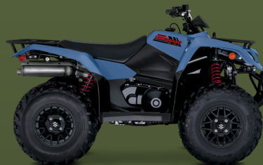
Armored Blue Gray

Whether you are working hard or getting away from it all, the 2025 Suzuki KingQuad 400ASI SE helps you every step of the way. The fully automatic Quadmatic™ transmission has 2WD and 4WD modes to handle rough trail conditions while completing even the most demanding chores. Along with exceptional engine performance across the powerband, its high-performance iridium spark plug, and Pulsed-secondary AIR-injection (PAIR) system help provide outstanding fuel efficiency and impressive performance.